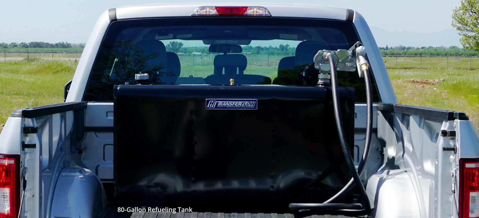
80-Gallon Refueling Tank