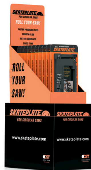
10-UNIT DISPLAY SKATEPLATE (Sidewinder/Wormdrive)

ATTRACT CUSTOMERS WITH THESE IN-STORE DISPLAYS!