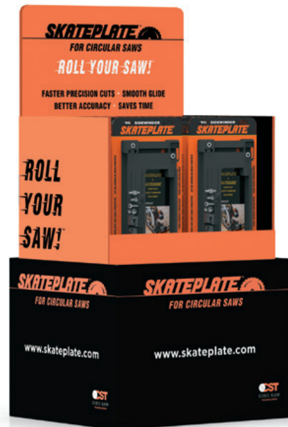
20-UNIT DISPLAY SKATEPLATE (Sidewinder/Wormdrive)