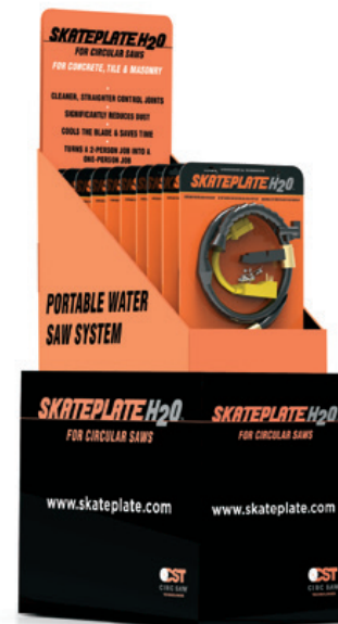
10-UNIT DISPLAY SKATEPLATE H2O KIT 20-Unit Display also available