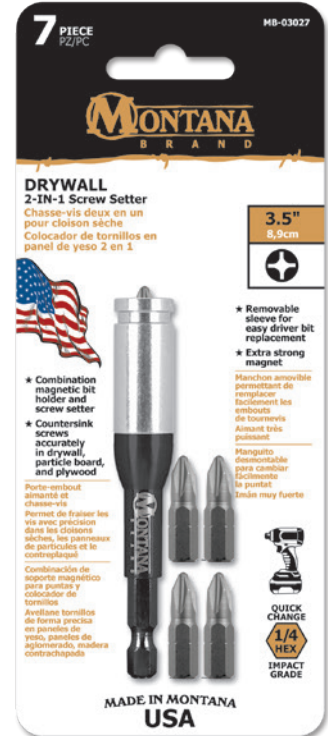
Packaging dimension: 2 7/8" x 6 7/8"