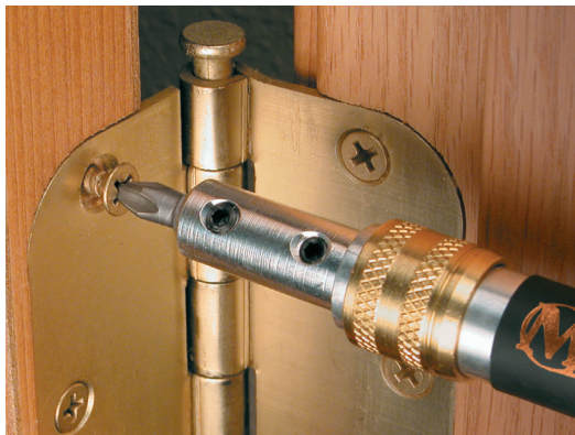
Drive the screw.