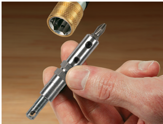
Flip the insert.