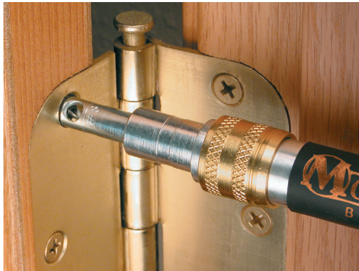
Pre-drill pilot hole.