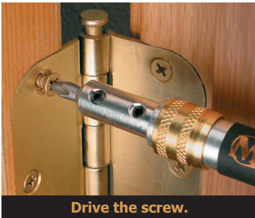
Drive the screw.