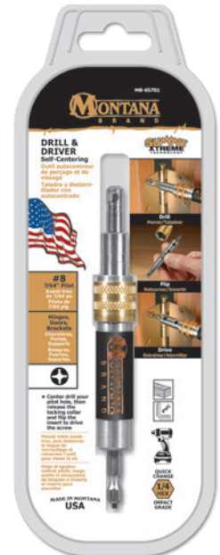
Packaging dimension: 3 1/2" x 9 9/16"