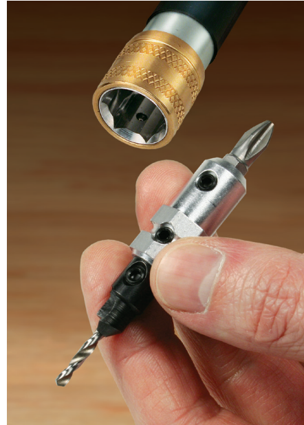
Flip the modular insert.