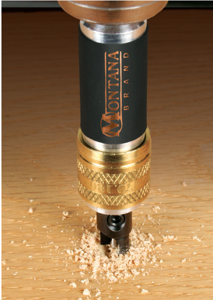
Drill, countersink or counterbore.