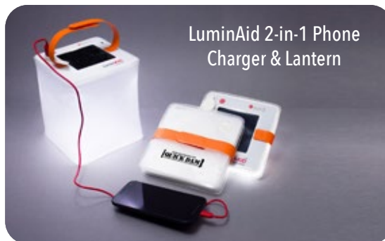
LuminAid 2-in-1 Phone Charger & Lantern