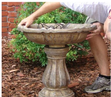
Step 1 - Twist and lock large tier to base pedestal