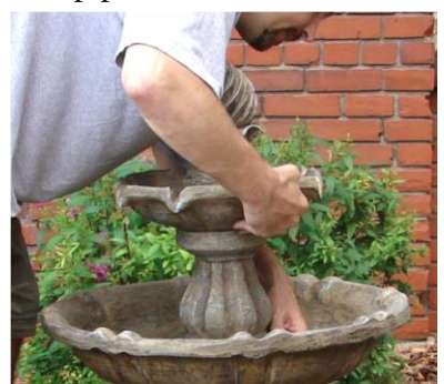
Step 7 -Twist and lock small pedestal to large tier