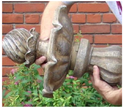
Step 5 - Twist and lock 2<sup>nd</sup> tier to small pedestal.