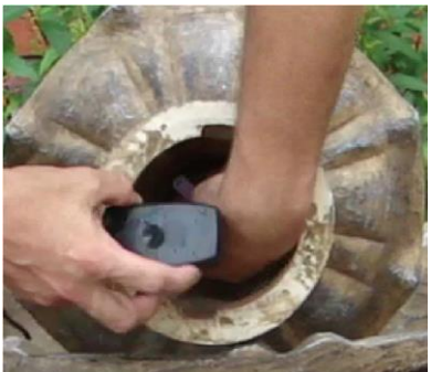
Step 6- Attach water hose to pump