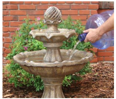
Step 8- Fill both tiers with water.