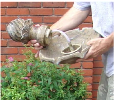
Step 3 - Feed water tube through 2nd tier