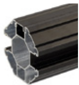
Aluminium Octagonal Post