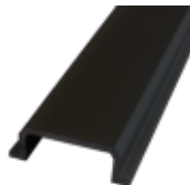
Aluminium Sliding Post Cover