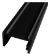
Aluminium sliding Post Cover