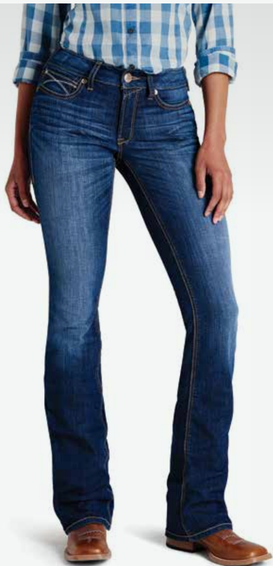
REAL BOOT CUT