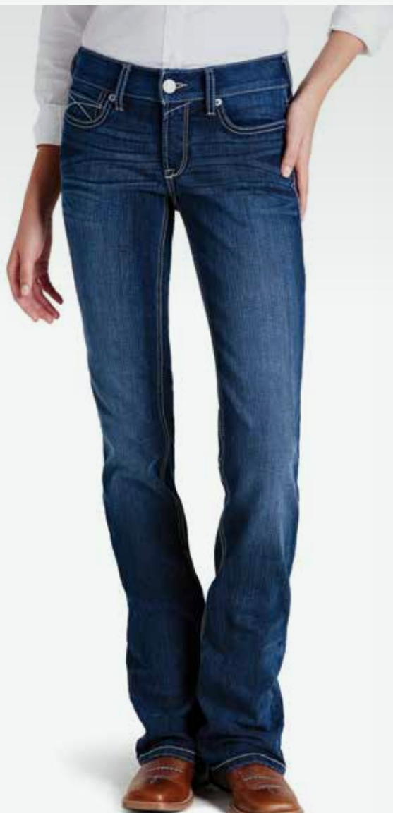
REAL BOOT CUT