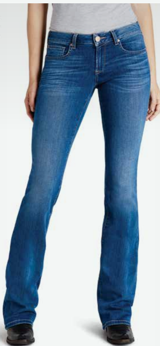
ULTRASTRETCH BOOT CUT