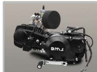
Powerful Engine 4-speed Manul (1-down / 3-up)