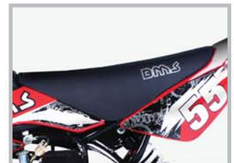
Comfortable Foam Seat Quality seat cover with improved grip