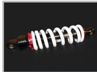
Rear Suspension High Performance Spring shock