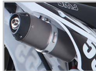
Performance Exhaust High Performance Muffler