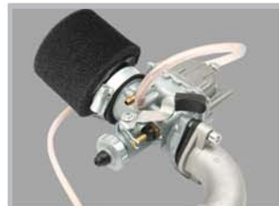
AIR INTAKE 26mm Carburetor with Racing Air Filter Filter