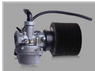
AIR INTAKE 16mm Carburetor with Racing Air Filter