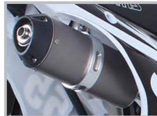
Performance Exhaust High Performance Muffler