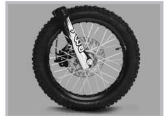
Steel Rims Front & Rear Black Painted Rims