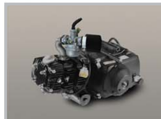
Powerful Engine 4-speed manual (1-down / 3-up)