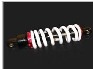
Rear Suspension High Performance Spring shock