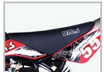
Comfortable Foam Seat Quality seat cover with improved grip