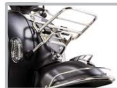
Front Rack Utility Rack