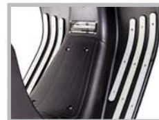
Aluminum Accent Floor Panel