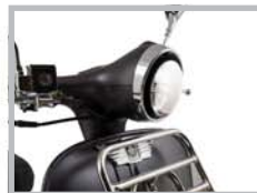
Inovative Design Halogen Headlights