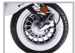
Premium Wheels & Tires White Wall tires with Aluminum Wheels