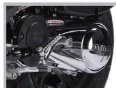
Chrome Cover CVT Engine Cover