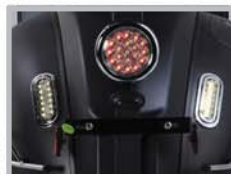
Tail Lights Tail & Signal Lights