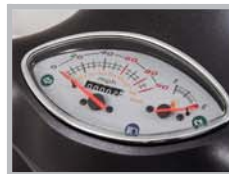
Instrument Gauges Stylish LCD Display