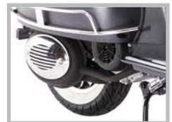
Chrome Muffer Shield