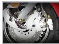
Front Brake Disk with Anti-brake pump