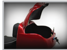
Rear Luggage Trunk With generous space.