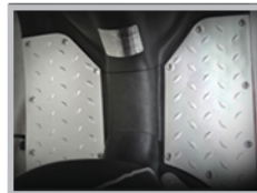
Aluminum Foot plates