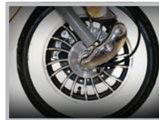
White Wall Tires Front & Rear