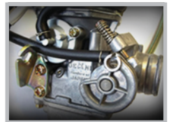
Deni Carburetor With Electric Choke