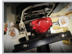
Elegant Tail lights With clear turn signal lens