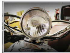
Chrome Covered Headlight Nice contemporary headlight design