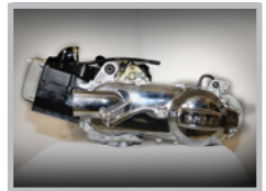
Chrome Covered Engine Luxury Chrome CVT Cover