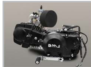
Powerful Engine 4-speed Manual (1-down / 3-up)