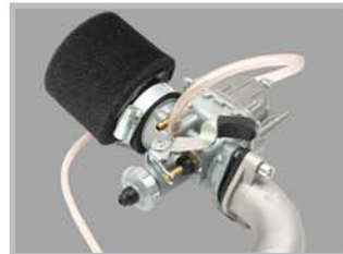
AIR INTAKE 26mm Carburetor with Racing Air Filter