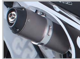
Performance Exhaust High Performance Muffler