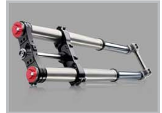
Front Inverted Shock Great Suspension