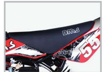
Comfortable Foam Seat Quality seat cover with improved grip