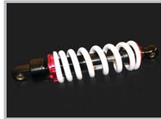
Rear Suspension High Performance Spring shock