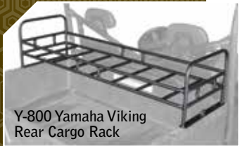
Y-800 Yamaha Viking Rear Cargo Rack

Available accessories that attach to your Hornet Yamaha Rack are Chainsaw Mount, Rifle Scabbard Boot, Spare Fuel Accessory, Quick Lift Jack and Mount, Spare Tire Bracket and more!