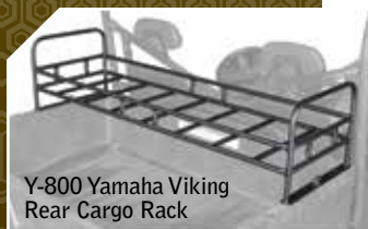
Y-800 Yamaha Viking Rear Cargo Rack

Available accessories that attach to your Hornet Yamaha Rack are Chainsaw Mount, Rifle Scabbard Boot, Spare Fuel Accessory, Quick Lift Jack and Mount, Spare Tire Bracket and more!