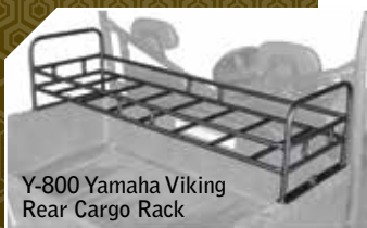
Y-800 Yamaha Viking Rear Cargo Rack

Available accessories that attach to your Hornet Wolverine Rack are Chainsaw Mount, Rifle Scabbard Boot, Spare Fuel Accessory, Hi Lift Jack and Mount, Spare Tire Bracket and Waterproof Dry Box.