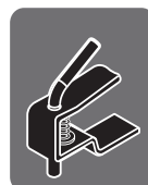
SPRING LOADED HITCH PIN WITH HANDLE