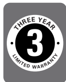
3-YEAR LIMITED WARRANTY