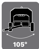
PATENTED SWIVEL DUMP 105°