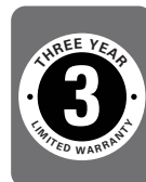
3-YEAR LIMITED WARRANTY