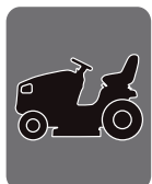
ATTACHES TO TRACTORS