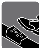
FOOT PEDAL DUMP RELEASE