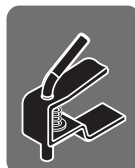
SPRING LOADED HITCH PIN WITH HANDLE