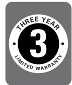
3-YEAR LIMITED WARRANTY