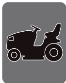
ATTACHES TO TRACTORS