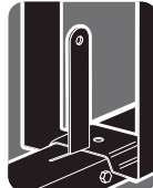
HAND LEVER RELEASE