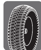
13" PNEUMATIC TURF TIRES