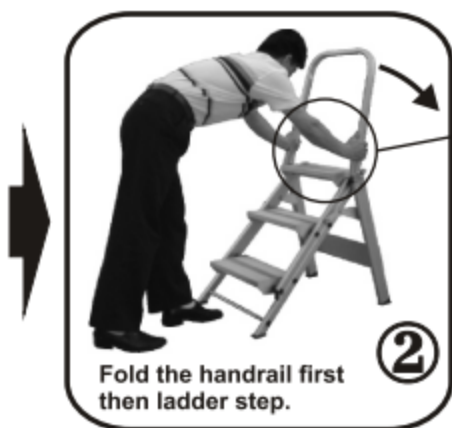
Fold the handrail first then ladder step.