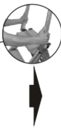
Always retract the safety handrail first by squeezing the handles at the base of the handrail