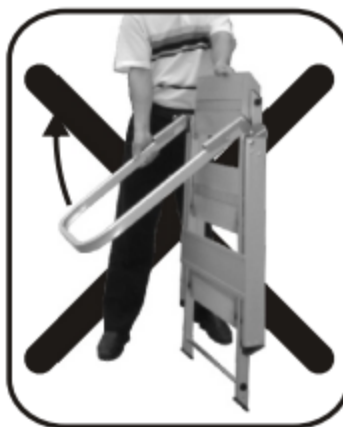
WARNING: Handrail must be down to open the step ladder. Failure to do so may result in damage