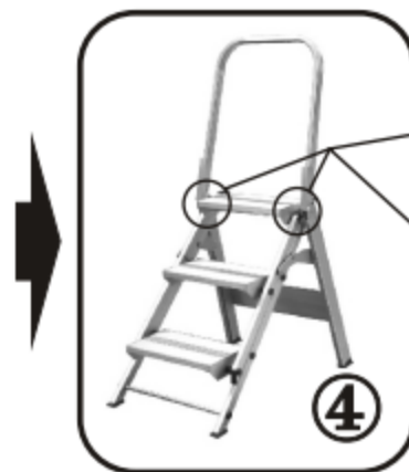
Listen for the audible click to ensure safety handrail is in the locked position