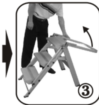
Next raise the safety handrail