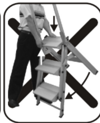
WARNING: Handrail must be retracted before closing the steps. Failure to do so may result in damage