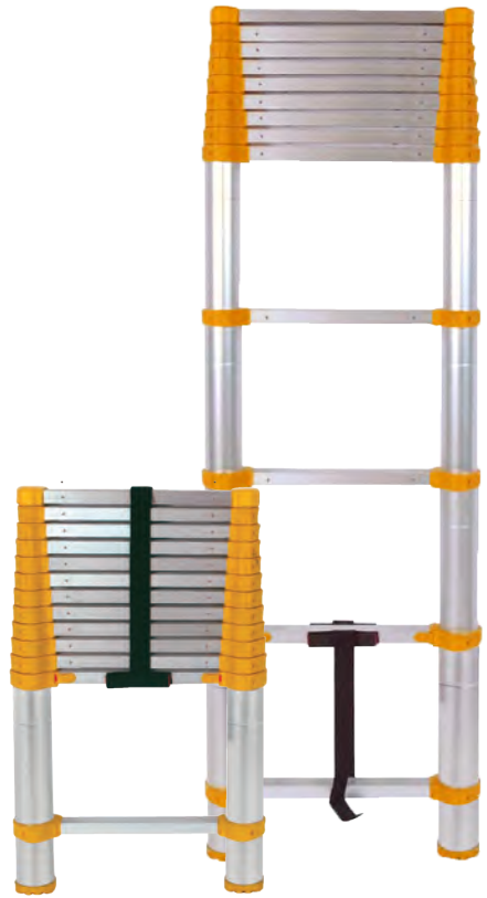
HOMESERIES™ PROFESSIONAL DIY + RESIDENTIAL 750P+ 760P+ 770P+