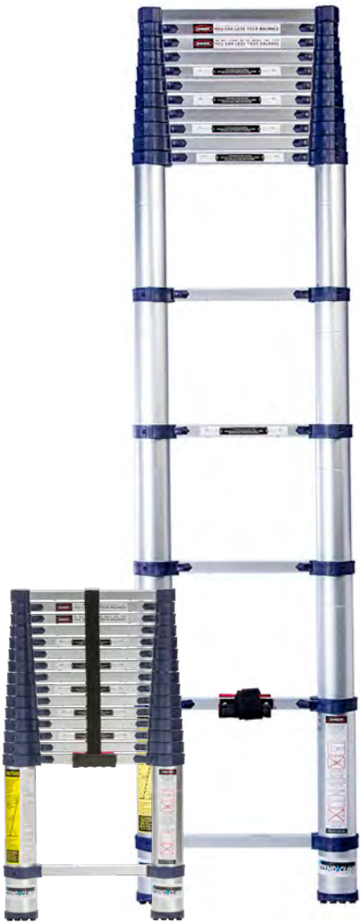
PROSERIES™ PROFESSIONAL DIY 780P+ 785P+