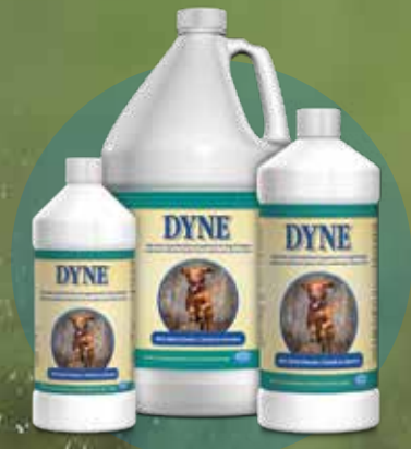
Available in 16 oz., 32 oz. and 1 gallon 174 calories per ounce

3 tsp (15 mL) = 1 tbs (15mL) • 2 tbs (30 mL) = 1 ounce (30mL)