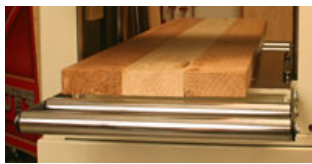
Table and Extensions

The main cast iron table and the twin-roller extensions add up to 36 1/2" of support that makes working with large pieces of wood much easier.