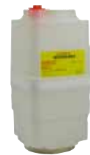
Sampling Filter (six pack) SFU15/6

HEPA CERTIFIED Omega Series Filter Cartridge - OF612HE-IC