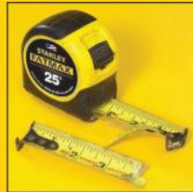
Torn or Damaged Blade

Blade torn by retracting at high speed, broken by being stepped on or accidentally cut by a power tool.