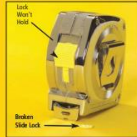
Defective Component Ruler shows little or no wear, no signs of abuse — but one of its components is broken or will not function correctly.