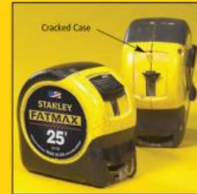
Mistreated or Abused

Bare metal showing on the blade; excessive wear on case exterior indicates that the tape measure is worn out.