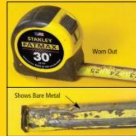
Worn Out Beyond Expected Life

Blade torn by retracting at high speed, broken by being stepped on or accidentally cut by a power tool.