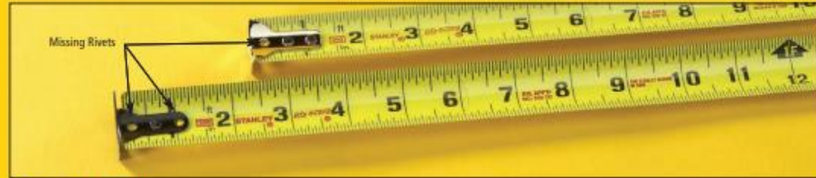
Missing Hook Rivets

A tape measure showing defects in material or workmanship like those shown below will be replaced free of charge. DO NOT RETURN PRODUCT TO STORE. Please call 1-800-262-2161 (M-F, 8-5 EST) or visit www.STANLEYTOOLS.com for details.