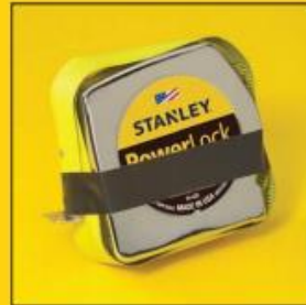
Broken Spring; Blade Will Not Retract Ruler shows little or no wear, no signs of abuse — but blade will not retract into the case or wants to feed itself out of the case mouth.