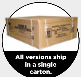
All versions ship in a single carton.