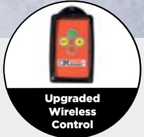
Upgraded Wireless Control