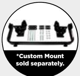
*Custom Mount sold separately.

All DK2 Snow Plows allow you to quickly & effectively remove snow from your driveway or small parking lot. DK2's range of personal plows each mount on to a vehicle specific custom mounting brackets. Ships in a single carton complete with hardened steel cutting edge scraper, rubber snow deflector, polymer-wrapped wire rope plow markers, skid shoes, castor kit for easy storage, and a 3,000lb wireless electric winch.