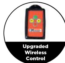
Upgraded Wireless Control