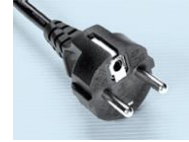
EURO plug 220-240 volt EURO prise 220-240 volts