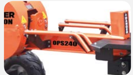
8" Expansive solid steel wedge