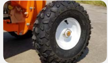
ATV Tires-locking - Off Road only