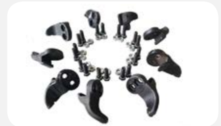
FREE Extra Set Of 9 Carbide Teeth