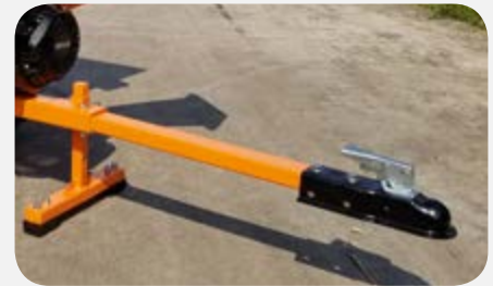
1 7/8" Removable Tow Bar