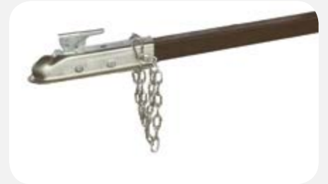
2 inch removable tow bar - D.O.T. Road Legal