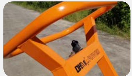
Adjustable Bow Handle With Heavy Duty Frame Mounting