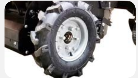
All terrain tires