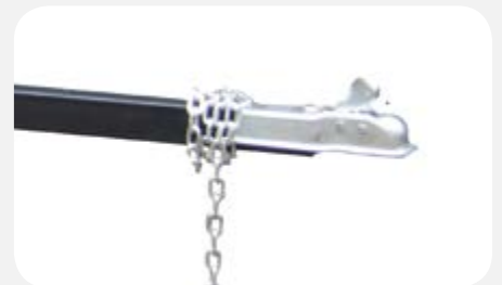
2 inch ball hitch