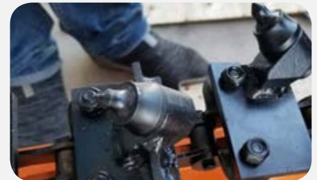
Tri-Cut High Carbide Teeth