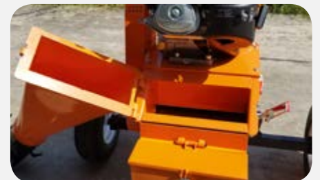
Extended Axle / Dual Swing Chutes / Tool Box