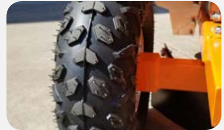
ATV Tires DUAL Locking - Off Road only