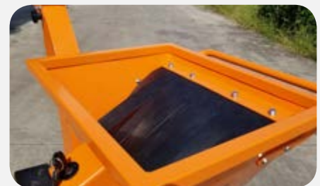
Large Feed Chute