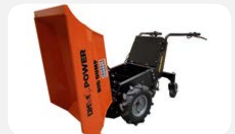
Vertical dump 90 degrees