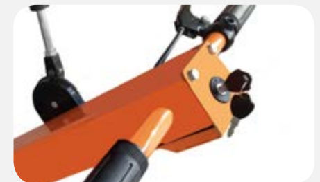
Lock out safety keys - Locking Throttle