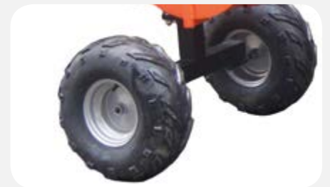
ATV Tires- Locking