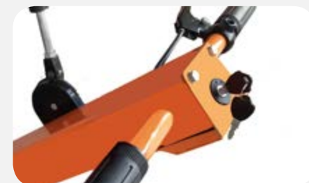
Lock out safety keys - Locking Throttle