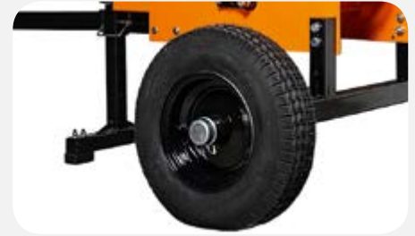
25MPH D.O.T. Tires