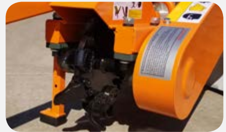
9 Carbide Cutting Head - Direct Drive