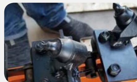
Tri-Cut High Carbide Teeth