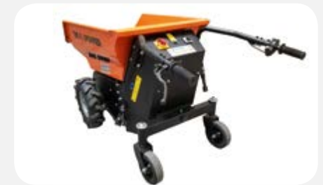
Max speed 6 mph