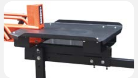
Oversize steel work table