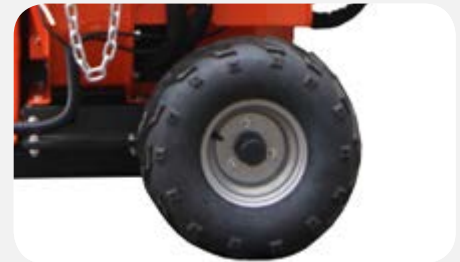
All Terrain On/Off road D.O.T. rated