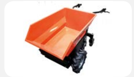
1000lb Max Capacity