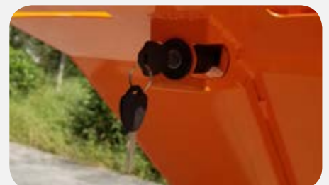
Lock Out Safety Keys