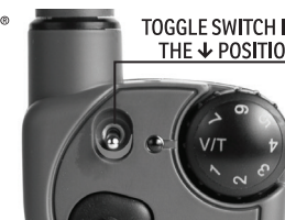
TOGGLE SWITCH IN THE ↓ POSITION

*Toggle switch only applicable to SD-1825X and SD-1825XCAMO