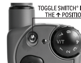
TOGGLE SWITCH* IN THE ↑ POSITION