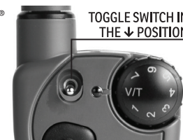
TOGGLE SWITCH IN THE ↓ POSITION

*Toggle switch only applicable to SD-1825X and SD-1825XCAMO