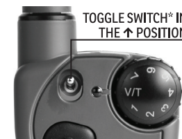
TOGGLE SWITCH* IN THE ↑ POSITION