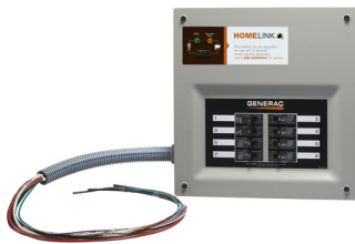
30 AMP Pre-wired Switch Model 6852