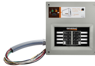
50 AMP Pre-wired Switch Model 9854