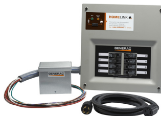
30 AMP Pre-wired Switch Kit Model 6854