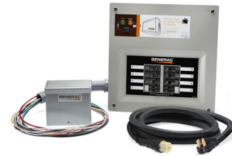
50 AMP Pre-wired Switch Model 9855