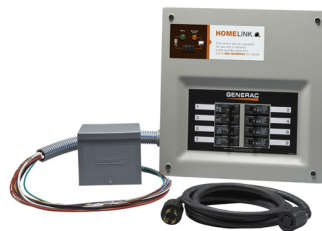
30 AMP Pre-wired Switch Kit Model 6853