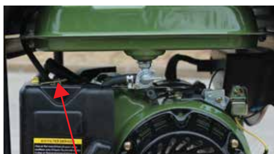
Choke (Figure B)