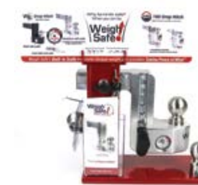
Houses (1) 6" drop/2" shank unit + accessories Part #: WSPOP-CT Dimensions: 7.85 x 18.5 x 21.3"