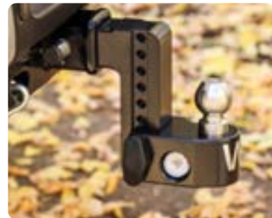
Also available in black cerakote aluminum!