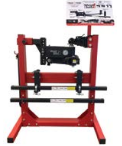
Houses (1) WD unit Part #: WSPOP-WD Dimensions: 33 x 51 x 28.25"