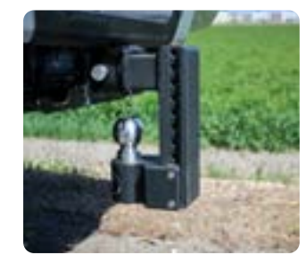
Stow when not in use!