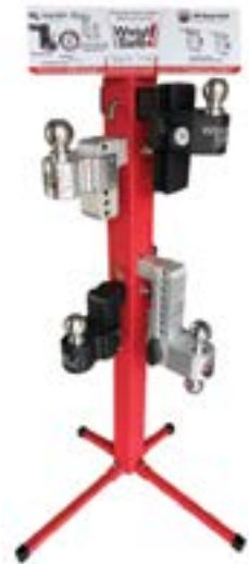
Houses (4) units + accessories Part #: WSPOP-HS Dimensions: 25.75 x 55.5 x 20.5"