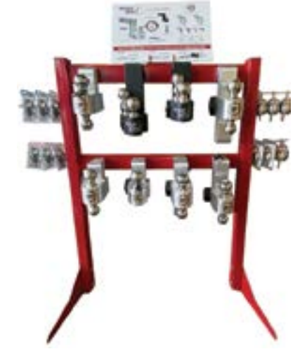
Houses (8) units + accessories Part #: WSPOP-XL Dimensions: 21.45 x 50 x 53.4"