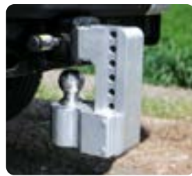
Stow when not in use! ***Except 3" shank sizes