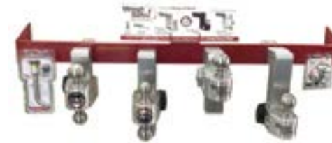
Houses (4) units + accessories Part #: WSPOP-EC Dimensions: 12.5 x 48 x 9.36"