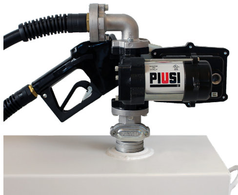
EX50 BASIC KIT - AUTO NOZZLE