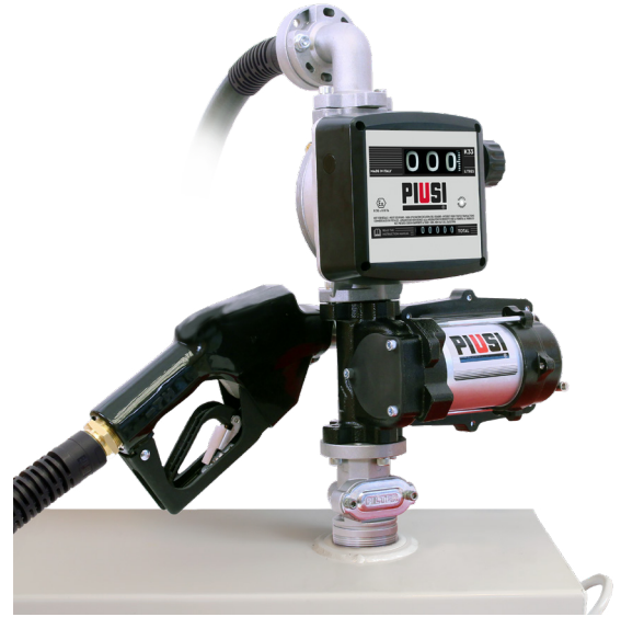
EX50 PRO KIT - AUTO NOZZLE + K33 METER