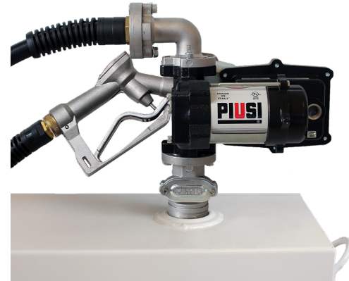
EX50 17 GPM BASIC KIT - MANUAL NOZZLE