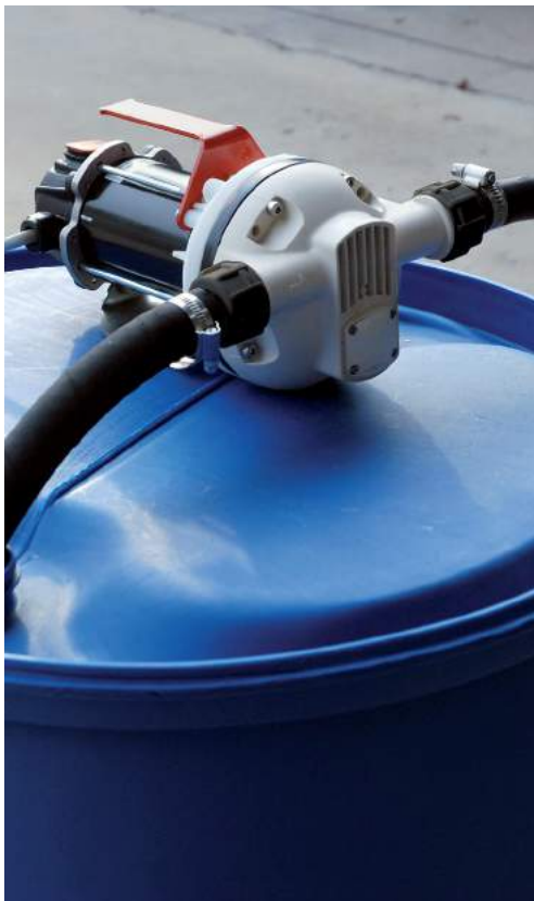
SUZZARABLU PUMP DC