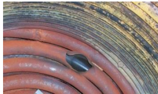
Pipe rupture due to freezing or obstruction

TEMPERATURE SWITCH: The burner is equipped with a high temperature limit switch, which will shut off the burner when the water temperature becomes too hot. Hot water machines are equipped with an adjustable thermostat so that the operator can control the outlet water temperature. The burner will automatically cycle on and off to maintain the desired temperature.