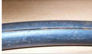
Failed pipe seam covered under warranty