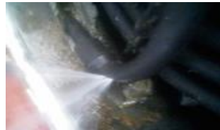
Blow out from pipe weakened by freezing