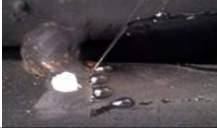
Failed weld or failed material covered under warranty

These pictures show different reasons for coil pipe failure: