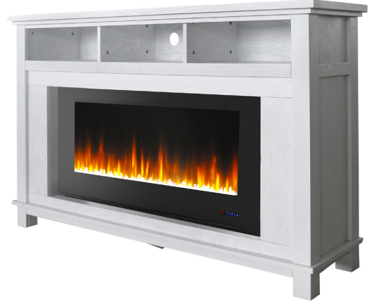
**Shown in the White finish

The electric fireplace insert produces 5,115 BTUs of fan-forced heat that can quickly heat a 300 sq. ft. room. An enchanting flame display dances across the back of the firebox, creating movement that is sure to catch your eye. Embers of LED light dance across the crystal rocks within, adding color and warmth to your entertainment room. The fireplace settings can be adjusted at the push of a button from across the room with the convenient remote control provided. The flames can be set to display with or without heat, making it perfect for use throughout the year.