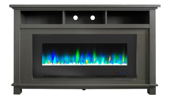
**Shown in the Gray finish