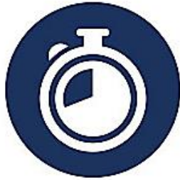
Set trap timer for up to 5 minutes

*We suggest wearing gloves when handling a trap that contains an animal. Stay clear until animal leaves trap.