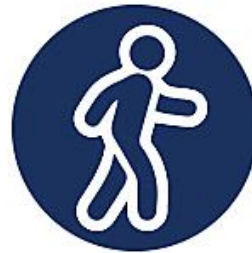
Walk a safe distance away from the trap