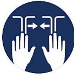
Unlock latch on release door of trap