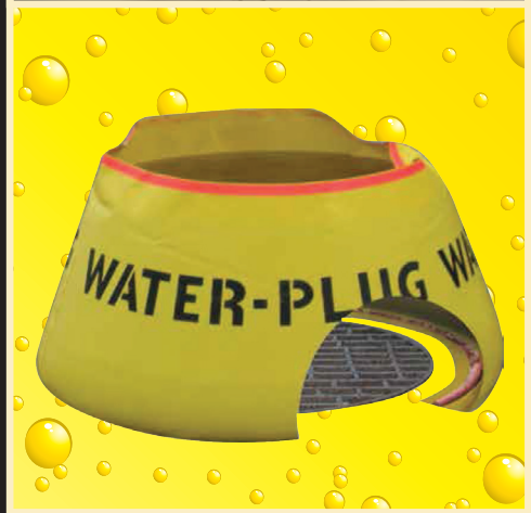
Water-Plug with open top & side cut away for visual purposes.

Retail ◆ Commercial ◆ Industrial ◆ Municipalities Rescue ◆ Transportation ◆ Environmental & More