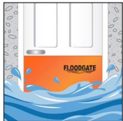
Creates water tight seal