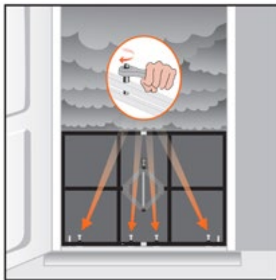
Bolt seals bottom