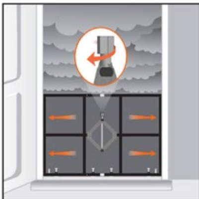
Jack expands and seals sides

Flood Gate: Easy to use. Installs in minutes.