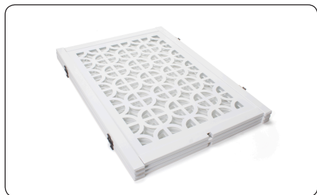
PRE-ASSEMBLED SECTIONAL PANELS