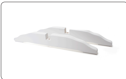
2 CUSHIONED WOODEN FEET