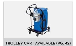
TROLLEY CART AVAILABLE (PG. 42)