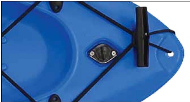
Drain Plug Location