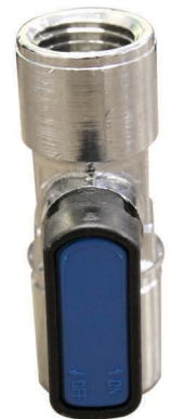
Valve in the "ON" Position WATER FLOW OPEN