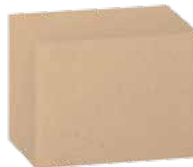
Double-corrugated drop-ship packaging.