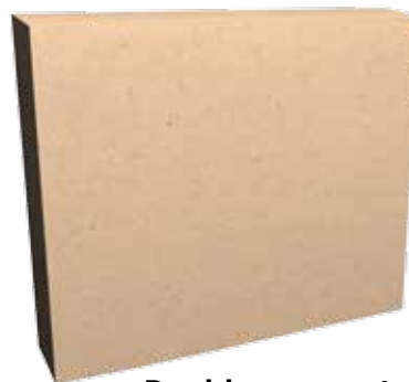
Double-corrugated drop-ship packaging.