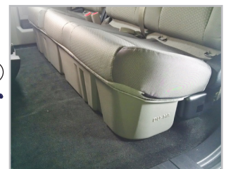
This is how the DU-HA should look installed under the back seat.

Pull the lever under each back seat to return the seat bottoms to the down position.